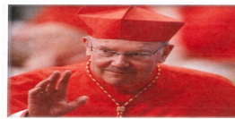
His Eminence William Cardinal Levada Prefect Emeritus Congregation for the Doctrine of the Faith